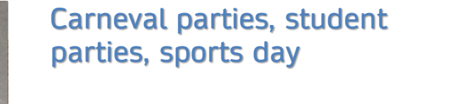
Carneval parties, student parties, sports day